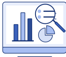
Data Analysis Service