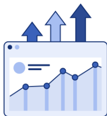
Industrial Data Services